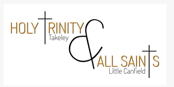
5 May 2024 News from the churches of Holy Trinity, Takeley I All Saints, Little Canfield