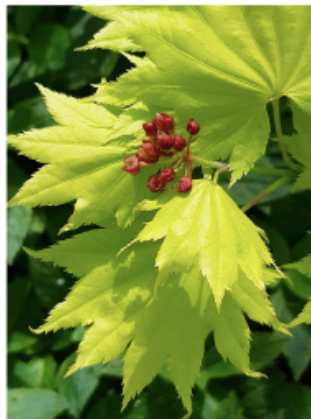
An Acer ( Acer Shirasawanum Jordan ). Photo taken by a volunteer in the Japanese-style garden at Easton Lodge.

Church of England | Diocese of Chelmsford Parish of Takeley with Little Canfield